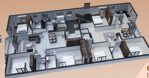
FIRST, SECOND & THIRD FLOOR PLAN