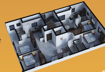
SECOND & THIRD FLOOR PLAN

SPECIFICATIONS STRUCTURE : RCC framed Structure JOINERY : Main Door - Teak Wood frame and Panelled Shutter Other Door - Modular flush door with teak wood frames Windows UPVC Frames Open (or) glazed shutter and M.S. Grills FLOORING : 2x2 Johnson Vitrified tiles over a layer of cement mortar KITCHEN : Glazed tiles, cladding 2'6" height over granite cooky platform and stainless steel sink. BATHROOM : (Jaquar tap fittings) Ceramic flooring and concept glazed tiles cladding upto 7'0" height. One EWC (Whitecolour, Parry ware Cascade equivalent brand) IWC for other toilet in each flat. Hot and Cold Water plumbing arrangements using Jaquar tap Fittings. Concealed line in CPVC and PVC for open line. One colour wash basin 20"x16" in common area and other in attached bathroom.