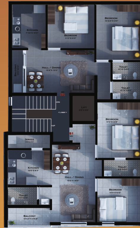
SECOND & THIRD FLOOR PLAN